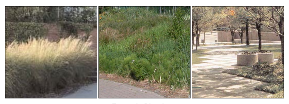
Example Plantings Exhibit 460-5

Provide plantings consisting of predominately native species in naturally occurring plant communities, designed to enhance the facility, and provide habitat value, seasonal interest and low maintenance. Specify plant species that are drought and disease resistant. Unless otherwise noted here or required by environmental permitting, provide plantings per WSDOT Roadside Classification Plan guidelines for Semiurban to Urban, Treatment Level 2.