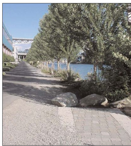
Pedestrian Walkways Along the Water Exhibit 460-6