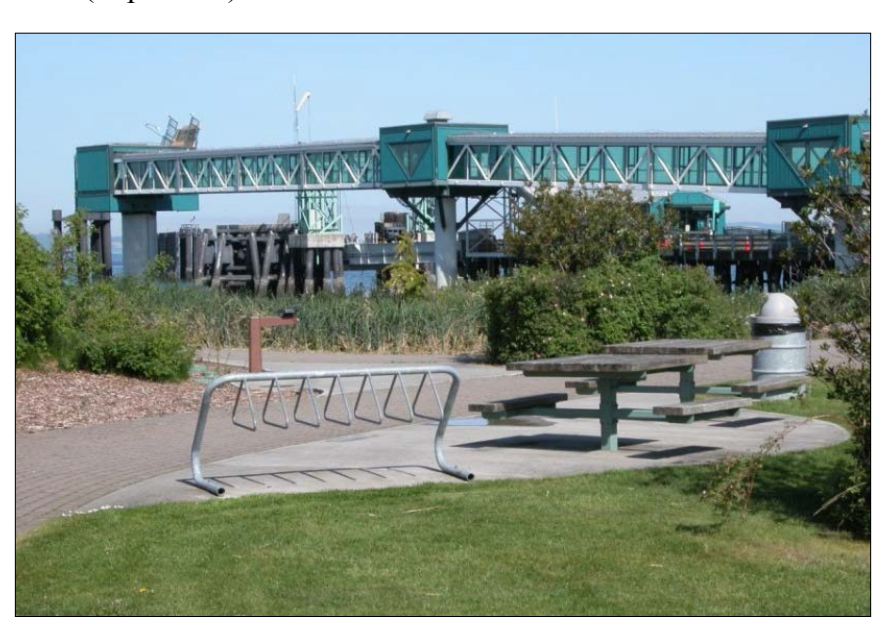
Site Furnishings at Edmonds Ferry Terminal Exhibit 460-8

Support overall site design language, particularly in pedestrian areas, with a repletion of site furnishings. Site furnishings include, but are not limited to: seating, bike racks, trash receptacles, decorative fencing, pedestrian railings, shelters, bollards, and mutt mitt dispensers (in pet area).