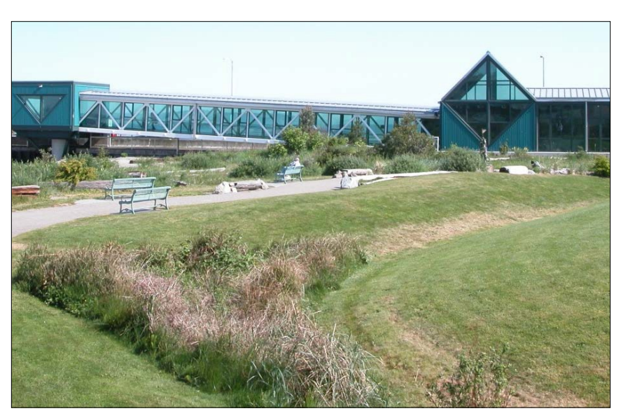
Biorentention Area Near Edmonds Ferry Terminal Exhibit 460-7

Design bioretention areas such as bioswales and biorention cells to incorporate naturalized wetland-type features, planted with native and adaptive water tolerant species. Specify plantings within the bioretention areas which meet the technical requirements for retention and treatment. For personal safety reasons and to maintain water views, provide lower growing species, primarily under 4 feet in height. Consider utilizing native trees, low shrubs and groundcovers to frame larger bioretention areas, help define these areas as distinct spaces, and provide habitat enhancement.