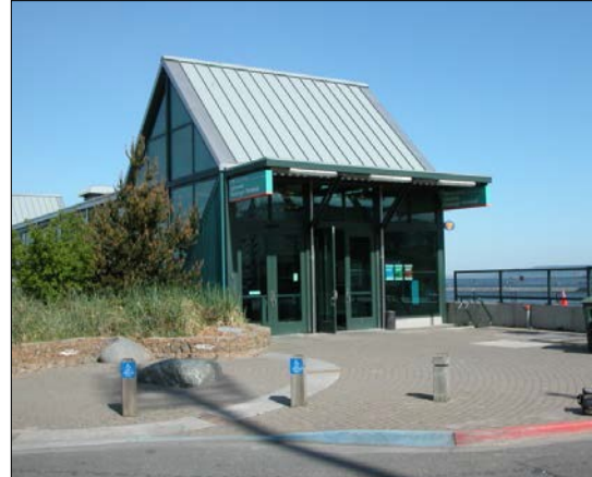
Example Terminal Entry Plazas Exhibit 460-2