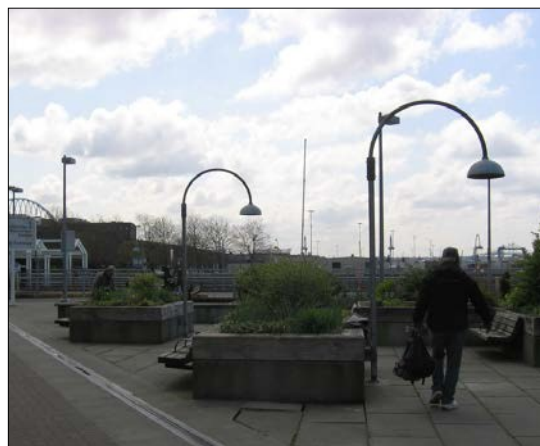
Landscaping Planters at the Seattle Ferry Terminal Exhibit 460-4

Landscaping work is comprised of the following: protection of existing valued vegetation; preparation of site soils for planting; installation of irrigation (as required); planting and permanent erosion control.