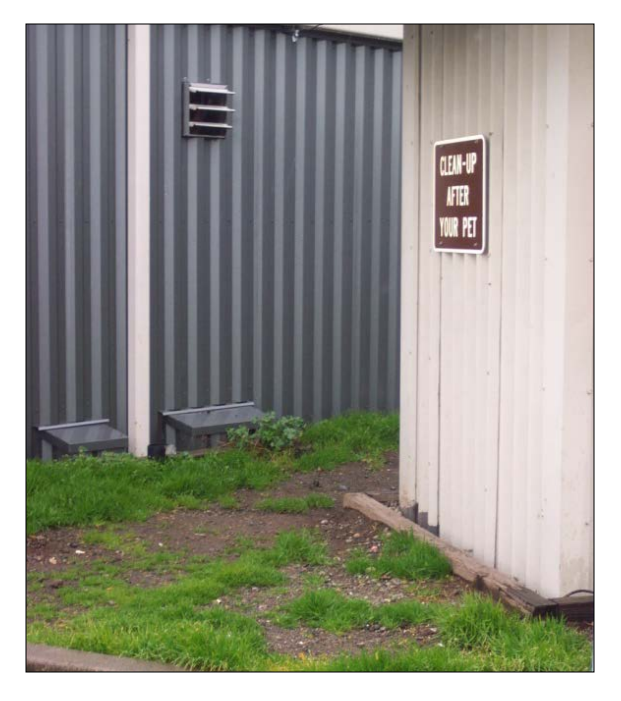
Pet Area at Seattle Ferry Terminal Exhibit 520-10