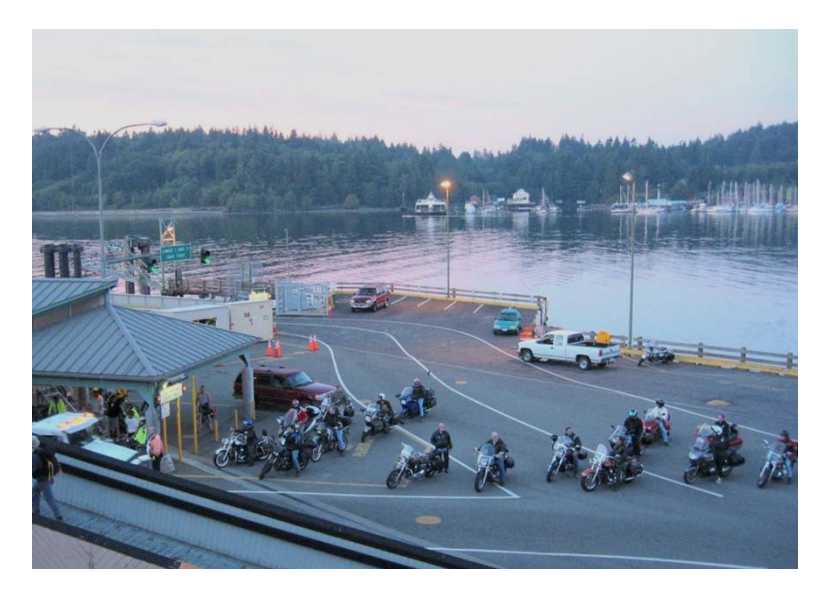
Bainbridge Island Ferry Terminal Motorcycle and Bicycle Holding Area Exhibit 520-7

Motorcycle access lanes are not to be combined with bicycle access lanes. For new terminal facilities, a 4-foot wide bicycle lane is required for both the vehicle holding and exit lanes. Motorcycle access is generally provided via unused vehicle holding lanes.