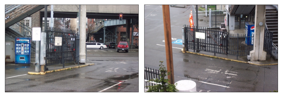
Seattle Ferry Terminal Passenger Amenities in Holding Area Exhibit 520-9