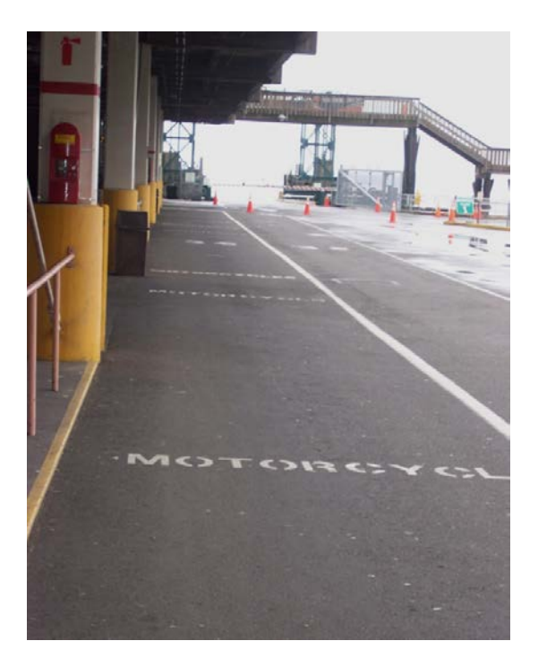
Seattle Ferry Terminal Motorcycle Access Lane Exhibit 520-8