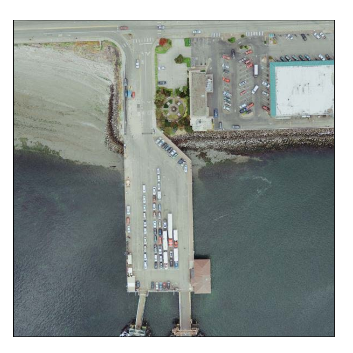
Over-water Vehicle Holding at Port Townsend Ferry Terminal Exhibit 520-4