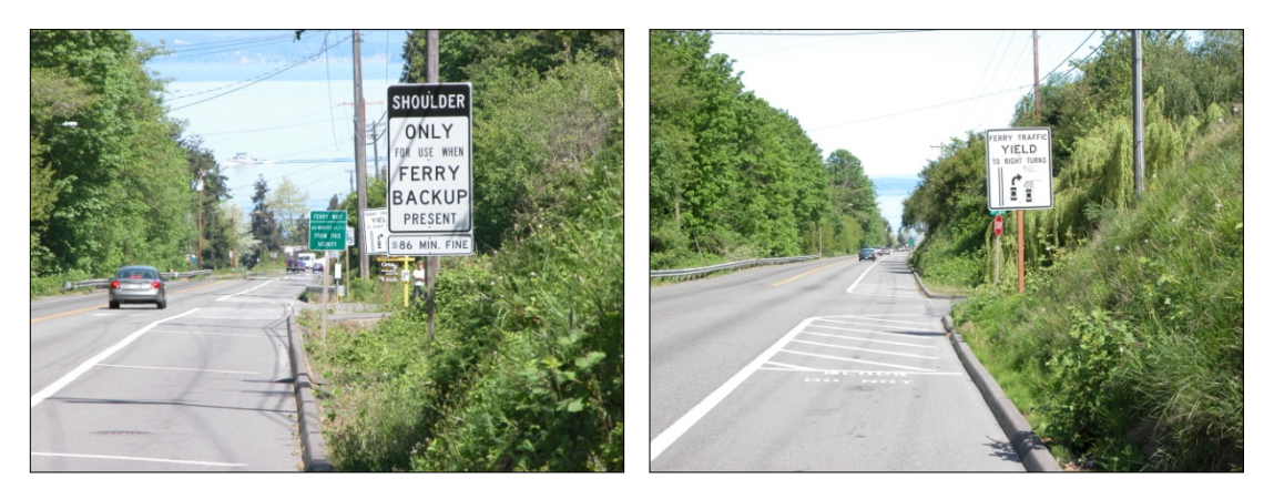
Mukilteo Ferry Terminal Vehicle Holding Lane on Shoulder Exhibit 520-5

Design the vehicle holding area with a capacity of one and one-half full boat loads<sup>1</sup> (per destination). The area associated with the "extra" one-half boat load allows for vehicle staging necessary to sort priority vehicles (as defined below) and maintain vessel headways. This rule of thumb for sizing the vehicle holding area does not address vehicle backups that may occur upstream of the holding area, if more than one boat load of vehicles is present for a given sailing. Currently, some terminals accommodate vehicle holding area overflow with a designated ferry holding lane along the shoulder of the terminal vehicle access road (referred to as a queuing lane), see Exhibit 520-5. Some terminals also have off-site vehicle holding lots.