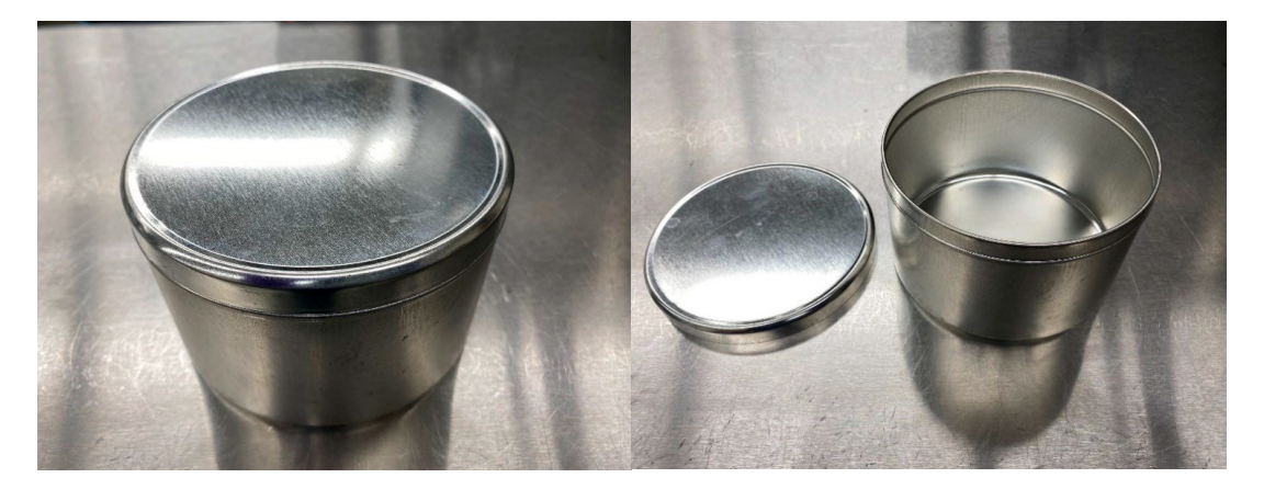
Figure 1 Pictures of acceptable 24-ounce aluminum container with lid off and on

6.7 The Bituminous Materials Section will notify the Contractor/Producer when the mix design materials have been received, logged-in and a calendar day completion will be provided to the Contractor/Producer as specified in Section 6.9.