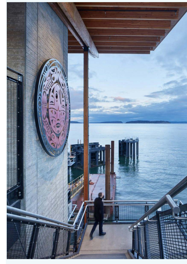
Mukilteo Ferry Teminal

During the construction of the new Mukilteo Ferry Terminal, WSF removed approximately 7,000 tons of creosote-treated piling from a former military fueling facility. This amount of creosote represented almost 4 percent of the estimated creosote remaining in Puget Sound at the time.