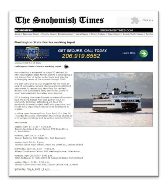
Article from the Snohomish Times