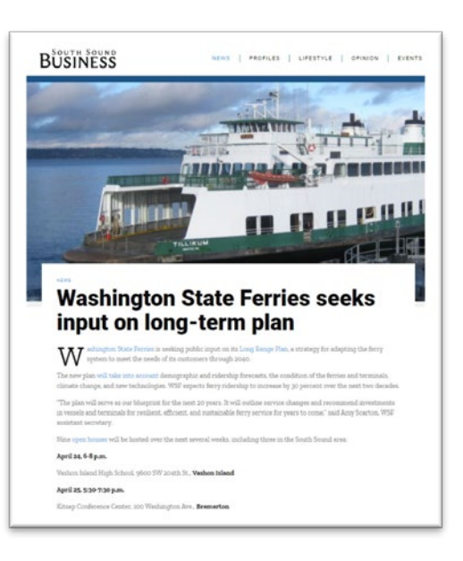
Article from South Sound Business magazine