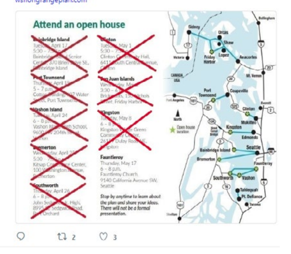
Fauntleroy open house tweet