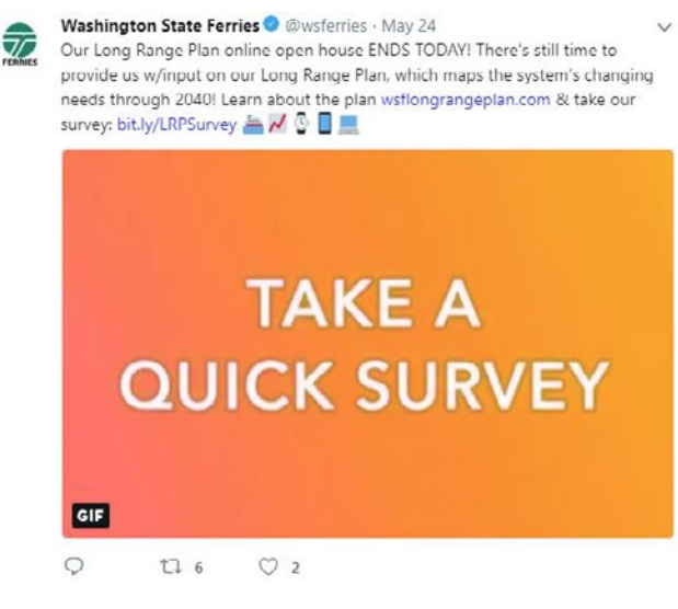
Online open house tweet