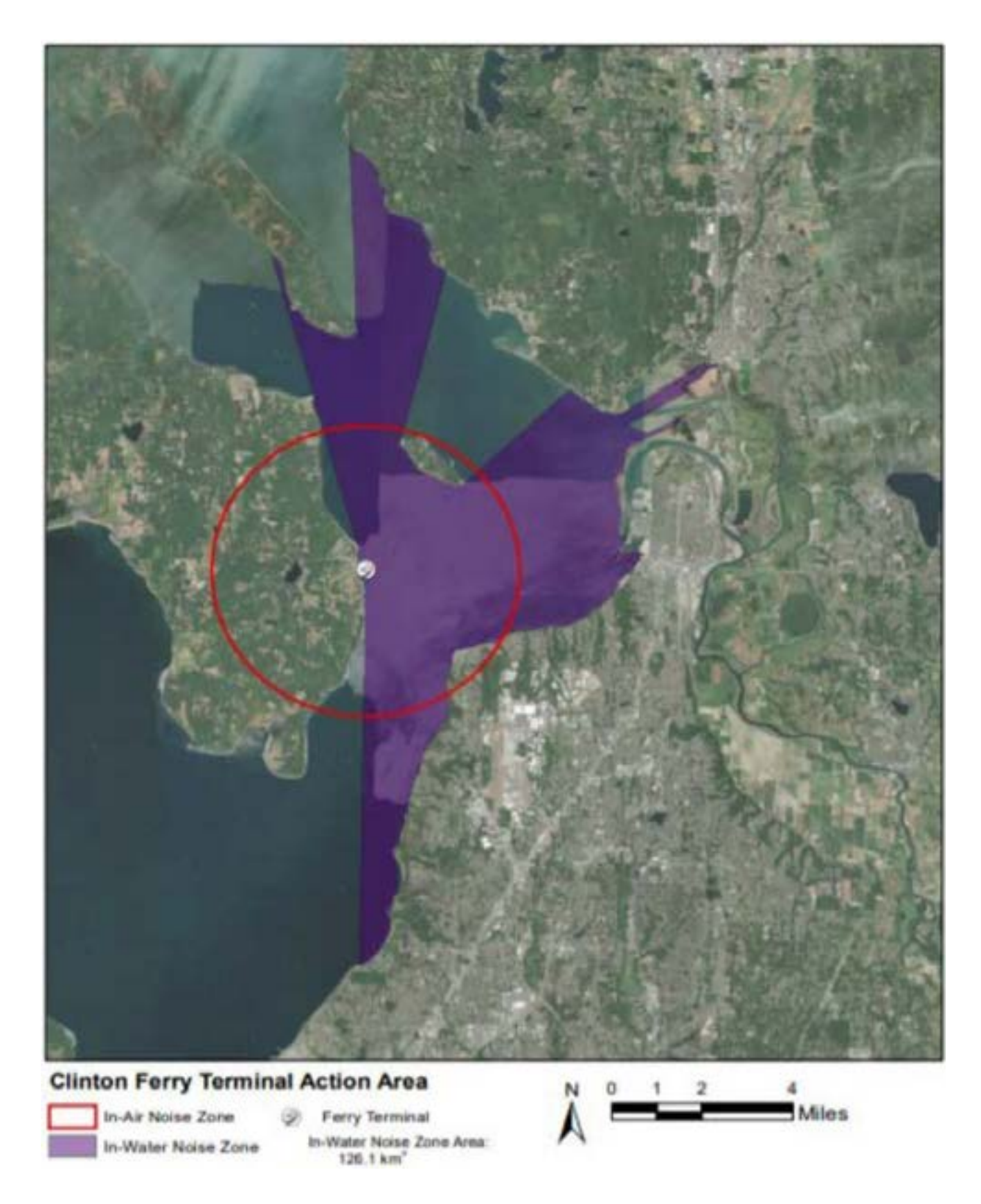
Figure 5. In-water Noise Zone at the Clinton Ferry Terminal.