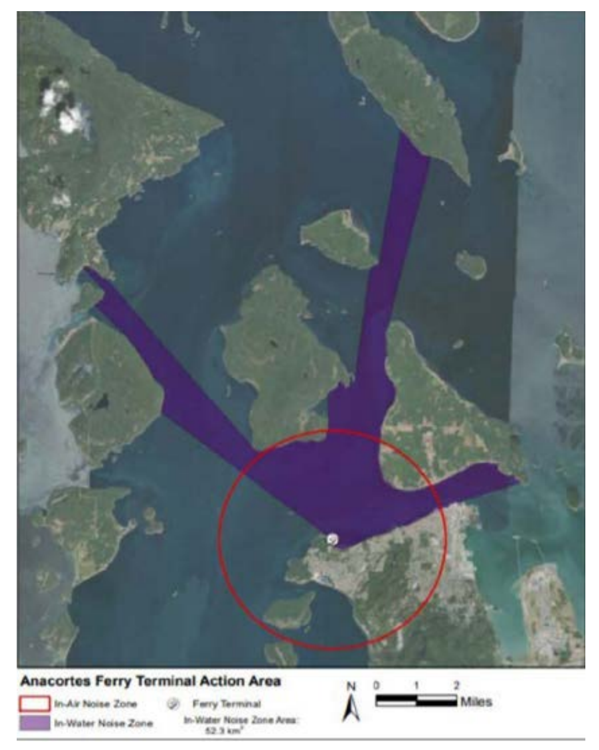
Figure 3. In-water Noise Zone at the Anacortes Ferry Terminal