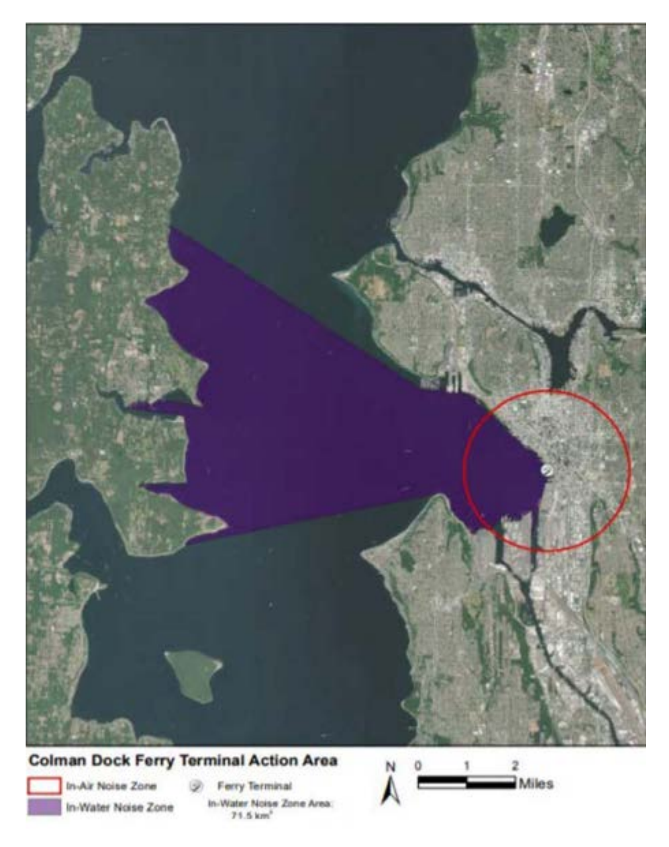
Figure 4. In-water Noise Zone at the Colman Dock Ferry Terminal.