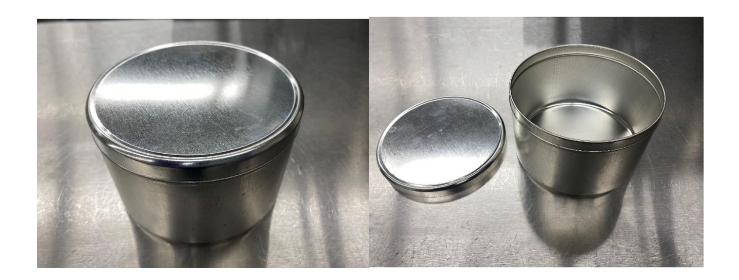
Figure 1: Pictures of acceptable 24-ounce aluminum container with lid off and on