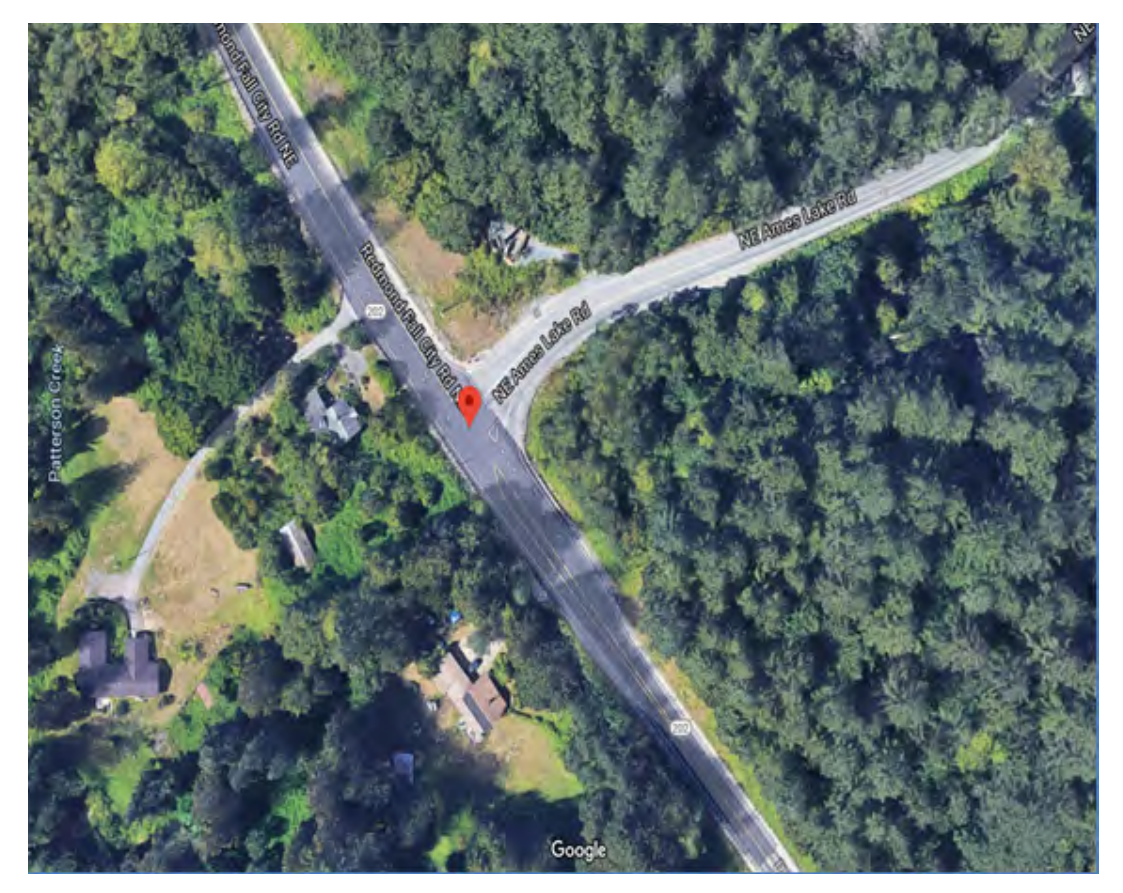
An aerial view of where Northeast Ames Lake Road meets SR 202.

FIGURE FOUR – INTERSECTION OF SR 202 WITH NORTHEAST AMES LAKE AND NORTHEAST TOLT HILL ROADS (MP 13.83 & MP 15.50 -.60)