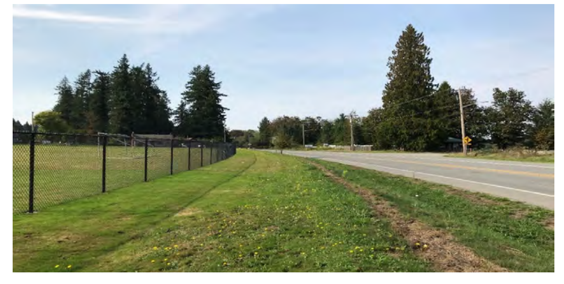
State Route 202 at the west end of the Fall City community as it passes by Chief Kanim Middle School

FIGURE TWO - SR 202 IN FALL CITY ADJACENT TO THE FALL CITY ELEMENTARY SCHOOL