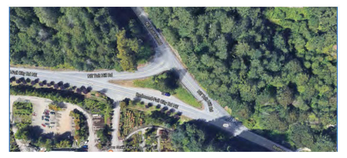
An aerial view of the Y-shaped intersection of Northeast Tolt Hill Road and SR 202, Tolt Hill splits into two for easier turns to and from SR 202 in either direction.