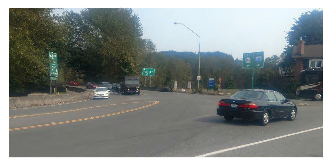
State Route 202 intersects with Preston – Fall City Road in central Fall City, creating a complicated intersection to navigate for users.

FIGURE THREE - SR 202 INTERSECTION WITH PRESTON/ FALL CITY ROAD IN FALL CITY