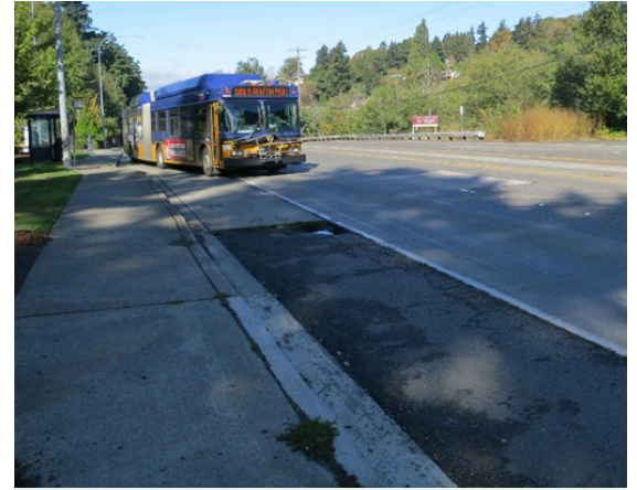
King County Metro bus stop on SR 900 near Creston Point Apartments.