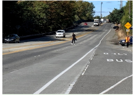
King County Metro bus stop on SR 900 Northwest of 68th Avenue South.